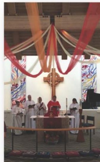
St. David's Episcopal Church, San Diego – Diocese of San Diego

Almighty God, on this day you opened the way of eternal life to every race and nation by the promised gift of your Holy Spirit: Shed abroad this gift throughout the world by the preaching of the Gospel, that it may reach to the ends of the earth; through Jesus Christ our Lord, who lives and reigns with you, in the unity of the Holy Spirit, one God, for ever and ever. Amen (Book of Common Prayer, p. 227).