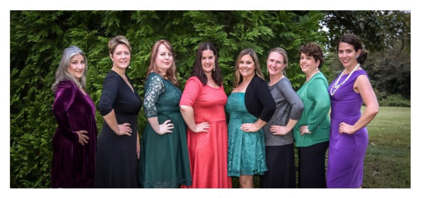
Saturday, May 4, 2019, 7:30pm Christ Church, Chaptico