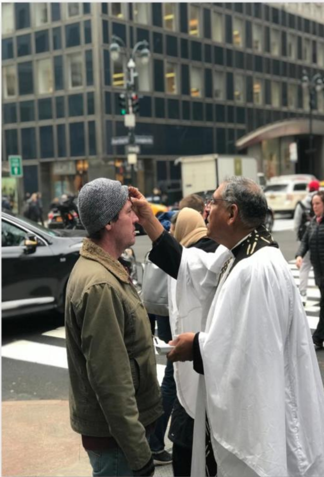
Ash Wednesday marks the beginning of Lent on March 6.

The period of 40 days, which traditionally does not include Sundays, commemorates the “40 days and 40 nights” (Matthew 4:2) that Jesus fasted in the desert and then resisted temptations from Satan.