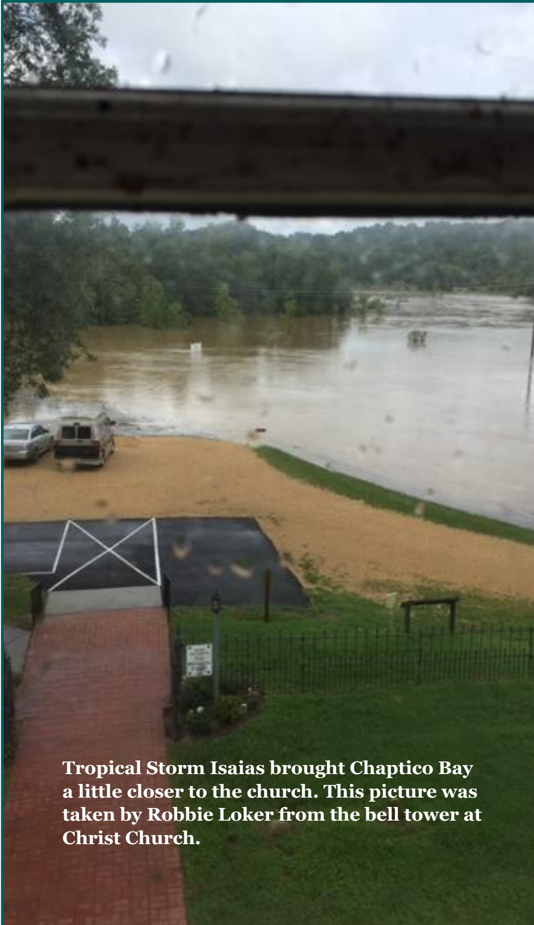
Tropical Storm Isaias brought Chaptico Bay a little closer to the church. This picture was taken by Robbie Loker from the bell tower at Christ Church.